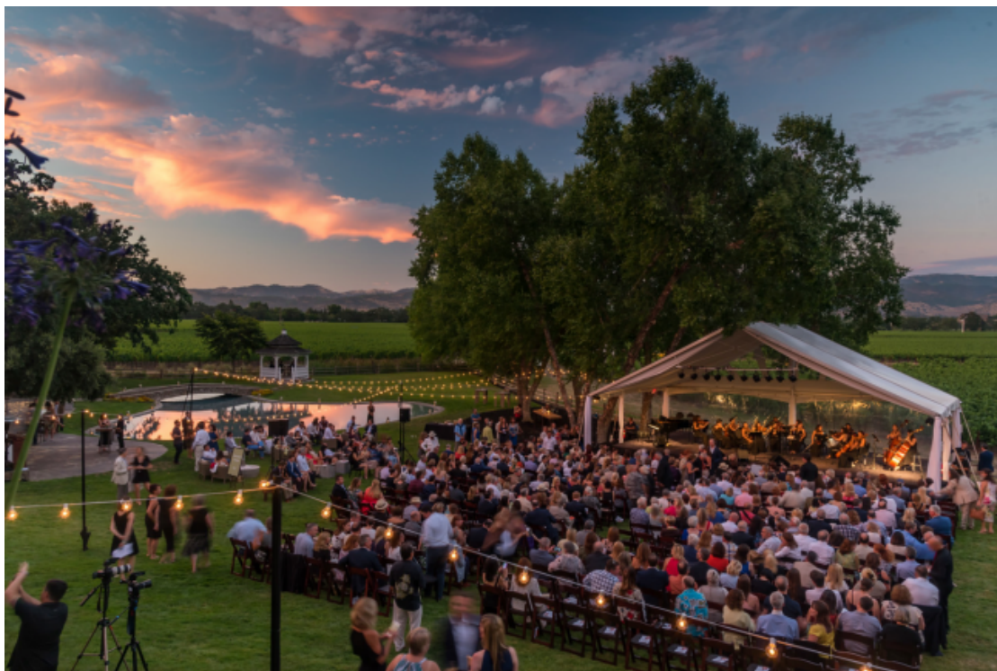
Joshua Bell, "Seasons of Cuba" at Far Niente

Published: July 27, 2017, 1:46 pm | Updated: July 27, 2017, 4:39 pm